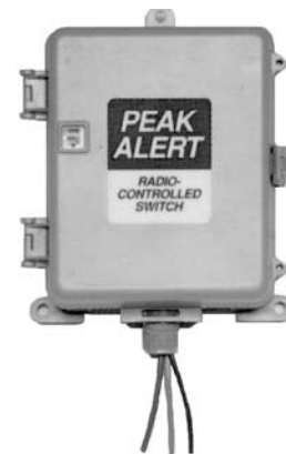
Radio-Controlled Switch (RCS)

Be aware of how you use electricity any time the weather is extreme, especially during those busy periods in the mornings and evenings. Listen for peak alert broadcasts on local radio stations and take steps to reduce your demand for power, such as delaying the use of the washer, dryer, or dishwasher until later, or waiting to take a bath or shower.