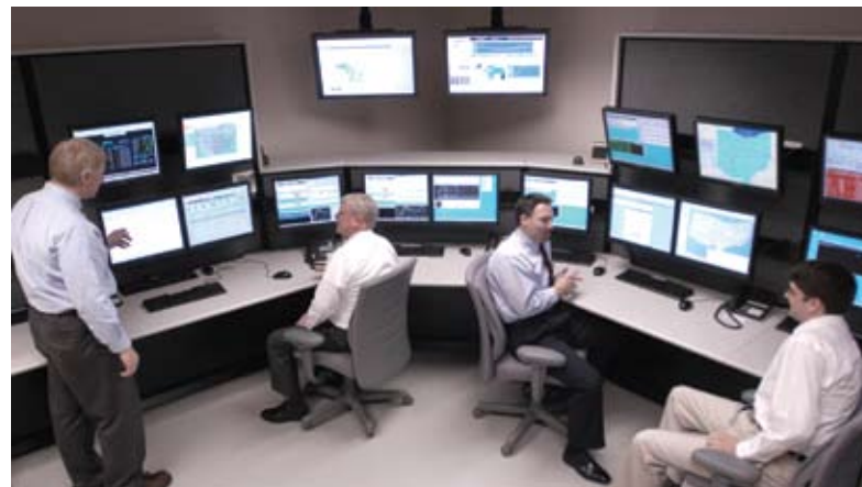
Load management control room at Buckeye Power