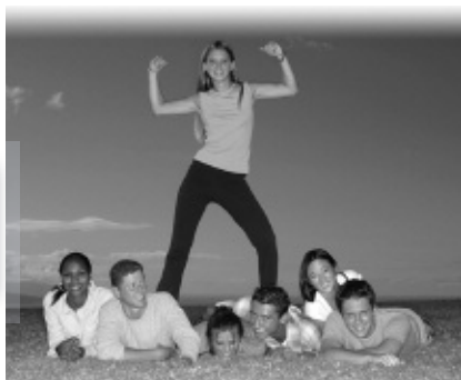
One $500 scholarship to the individual who is going to represent Mid-Ohio Energy at the statewide competition.

Four $1,550 scholarships will be awarded